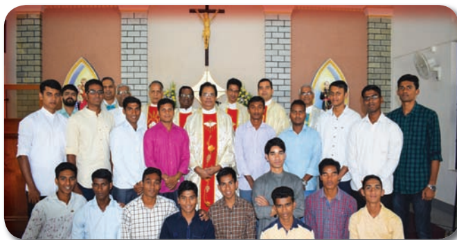
18 Novices from four Claretian major organisms of India begin their Novitiate in Bengaluru on 30 May 2018.