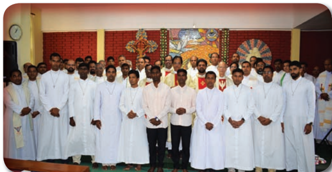
On 31 May 2018 eight of our Students make their Perpetual Profession and eleven of our Students renew their vows.