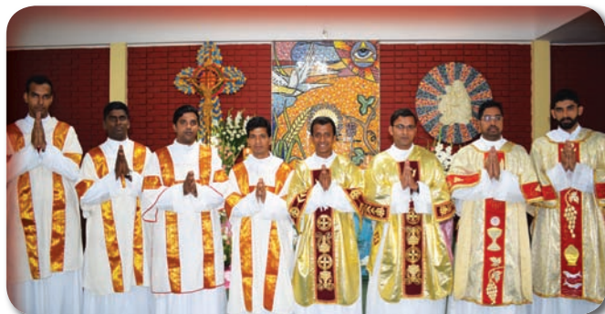
On 28 June 2018 eight of our Students are conferred the Order of Diaconate.